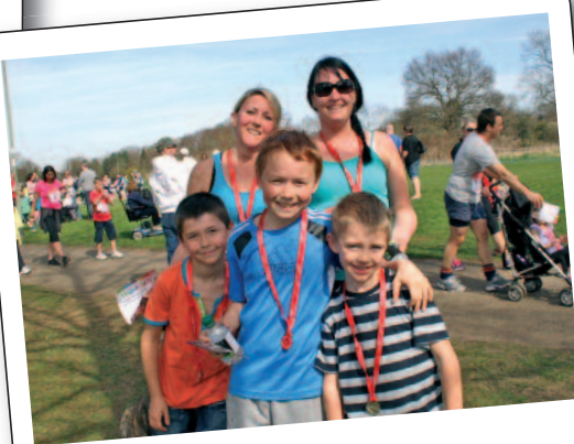
Family fun for a good cause

Woking Borough Council would like to thank all organisations and individuals involved in this year's Sport Relief, including: Woking Association of Voluntary Services, Sainsbury's Brookwood, Woking Hockey Club, Woking Youth Council, Goldsworth Park Community Association, Woking Football Club, British Red Cross, Beaufort Community Primary School and council staff and volunteers.