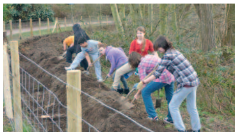
TOP RIGHT: Farnborough students