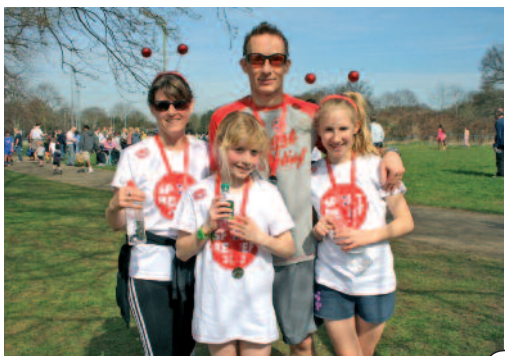
Bobbing along for Sport Relief Mile

Woking residents had to run for their money in Goldsworth Park as they took part in the Sport Relief Mile.