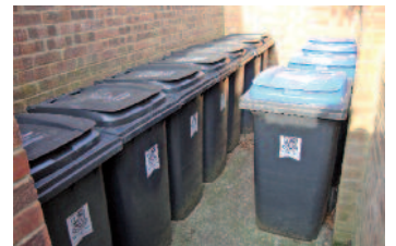
Tidy bin area