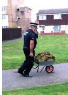
Surrey Police lending a helping hand