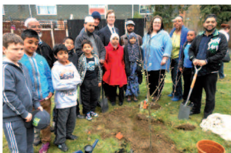
Everyone got involved – young and old!