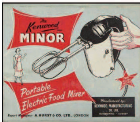
Kenwood Minor A305 Packaging, 1950s, by Kenwood

'The Art of Design: Kenwood in the Kitchen' is the new, free exhibition opening on 28 April 2012 at The Lightbox gallery and museum in Woking, Surrey and will explore the success of the Woking-born company that has transformed the kitchen.