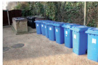
Tidy parking area