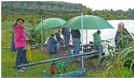
A fishing family