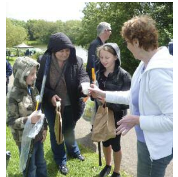
A cup of maggots