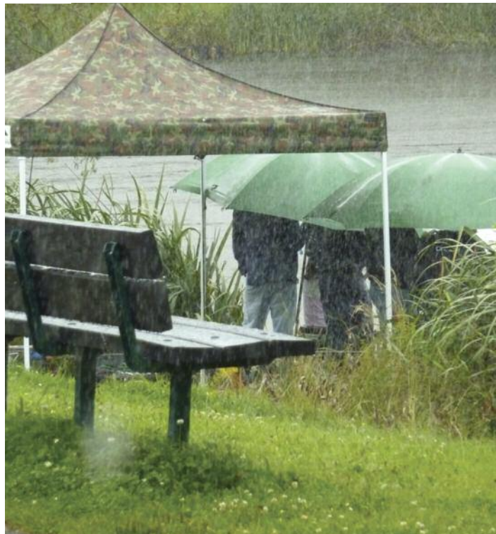
What a downpour