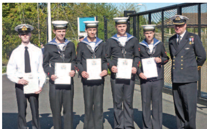
Presentation of Certificates

event and did exceptionally well being coming 4th in the ASC class.