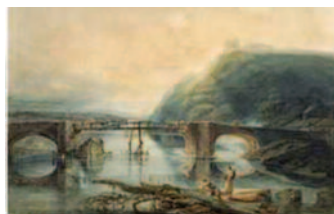
J.M.W. Turner, Llanello Bridge and Dynevor Castle, 1796