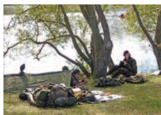
Royal Marine Cadets