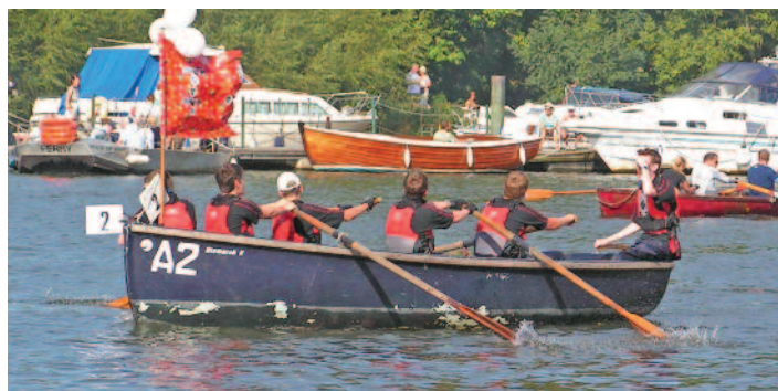
A well oiled crew, sprinting to the finish

Donations towards their fundraising activity can be made on www.charitygiving.co.uk/woking-scrriverrace