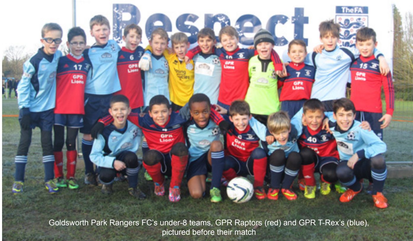
Goldsworth Park Rangers FC's under-8 teams, GPR Raptors (red) and GPR T-Rex's (blue), pictured before their match

Check with Woking Borough Council's Planning Department for details of the proposed new play equipment – www.woking.gov.uk - Plan/2014/1367