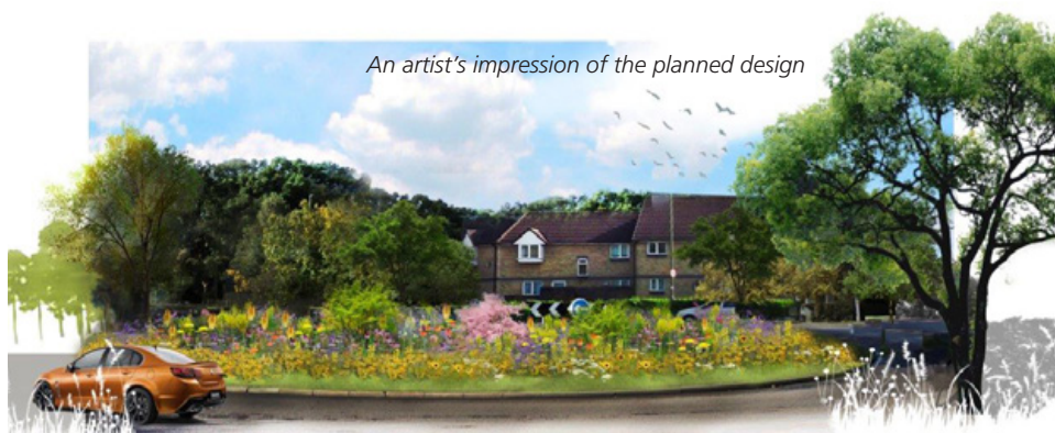
An artist's impression of the planned design

The planting is planned for this year, for flowering from spring 2016. With around 40 different species, the new design will provide high visual impact and be good for pollinators and birds.