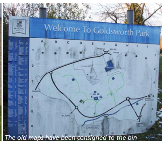
The old maps have been consigned to the bin