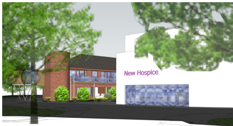
An artist's impression of the planned new entrance for the Hospice building

On Wednesday 11th February Woking & Sam Beare Hospices (WSBH) was delighted to be granted planning permission for the development of its new Hospice located in Denton Way, Goldsworth Park, Woking.