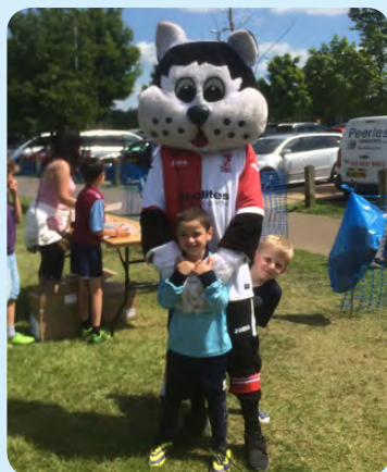
Woking FC's KC Kat also paid the tournament a visit