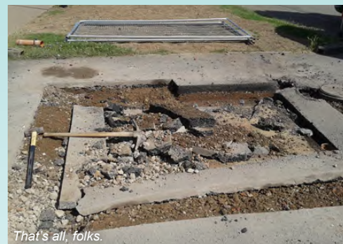
That's all, folks.