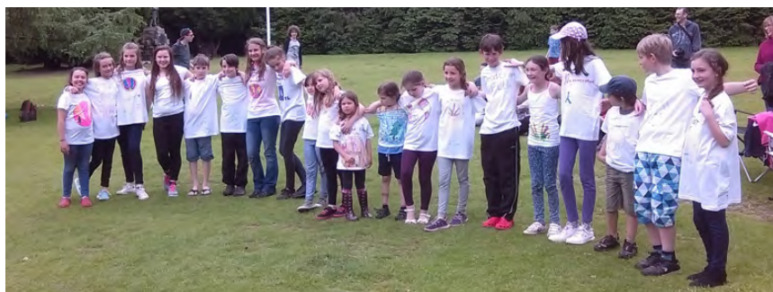
Knaphill and Walton districts show off their fabric painted celebratory t-shirts