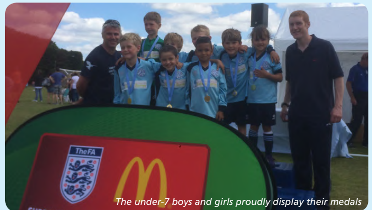
The under-7 boys and girls proudly display their medals

Any children interested in joining our local club should email chairman@gprfc.org . We are particularly looking for boys and girls that will be in year 2 at school in September.