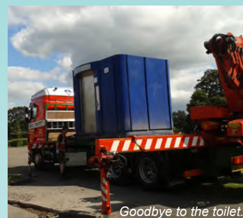
Goodbye to the toilet.

After five years of vandalism, the Council decided to remove it but not replace it. The GPCA orchestrated a campaign which produced a petition with nearly 750 signatures, support from our Councillors and MP, and publicity in the local and national press, radio and TV. The Council finally agreed to provide new public toilets and, a year later, work has finally started.