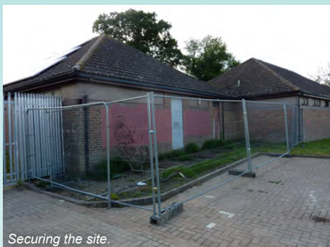
Securing the site.