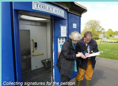
Collecting signatures for the petition.