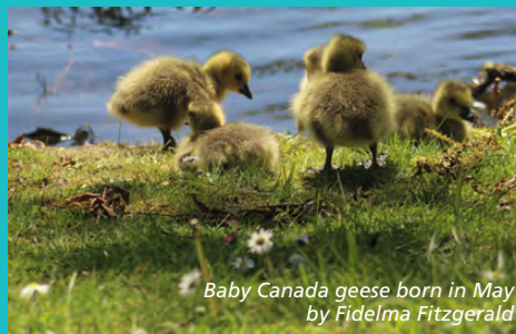
Baby Canada geese born in May

If you fancy a dabble and have a rod licence, do come and have a go. Day and annual permits are available from one of our bailiffs