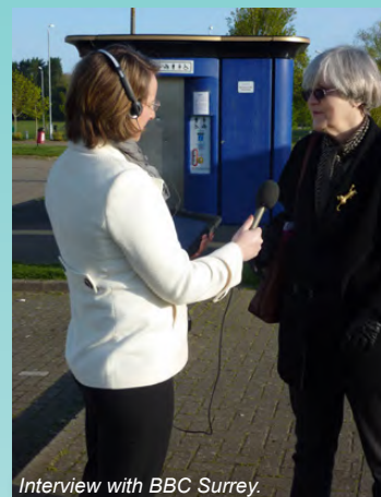
Interview with BBC Surrey.