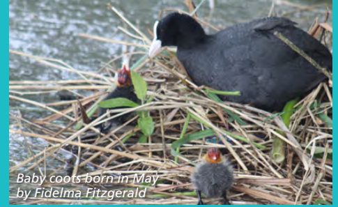
Baby coots born in May

on the bank. The best baits for bream and roach are maggots, corn or pellets and good quality boilies for carp. Please remember, no pike or lure fishing until 1st October.