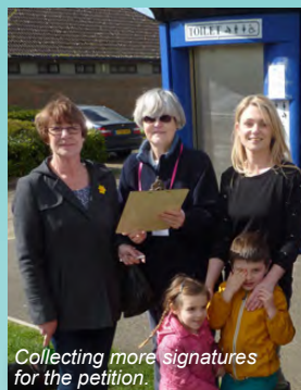
Collecting more signatures for the petition.