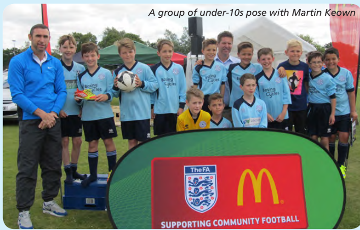
A group of under-10s pose with Martin Keown