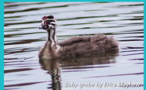
Baby grebe

If you would like to know more about the Angling Club, you can go online – search Goldsworth Park Lake Fishing – or give me a call on 07779 896393.