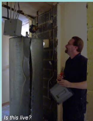
Is this live?