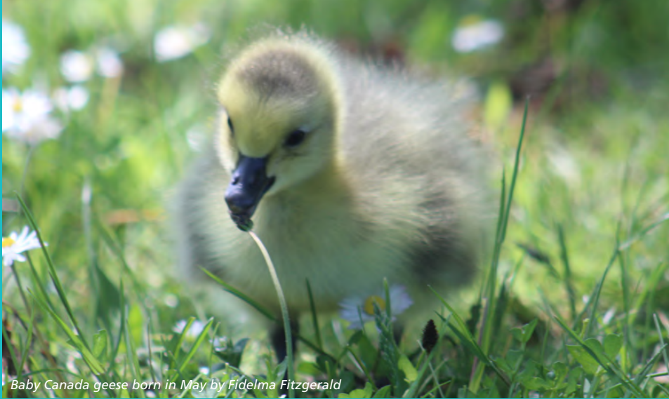
Baby Canada geese born in May