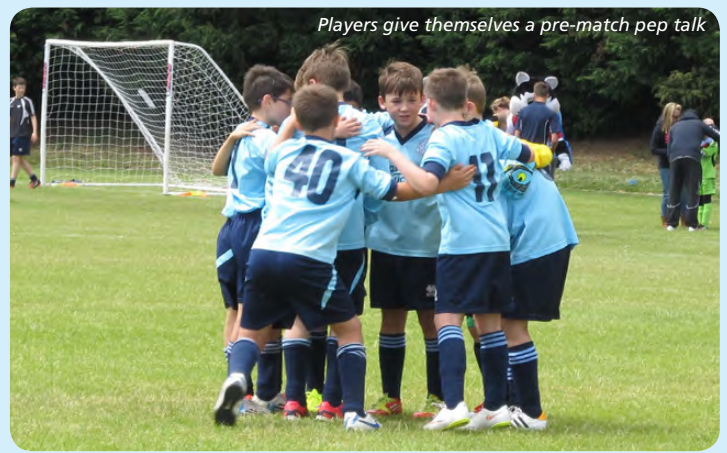
Players give themselves a pre-match pep talk