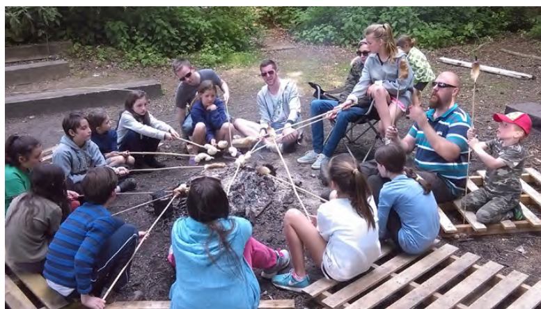
Knaphill and Walton districts baking bread over campfire