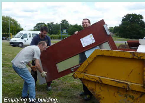
Emptying the building.