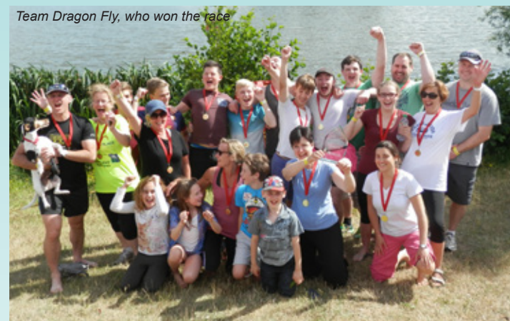
Team Dragon Fly, who won the race