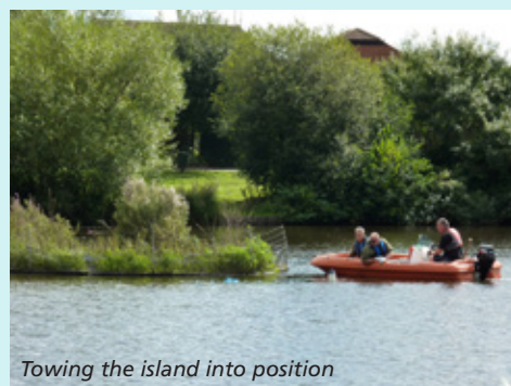
Towing the island into position

If you would like to know more about the Angling Club, you can go on line – search Goldsworth Park Lake Fishing – or give me a call on 07779 896393.