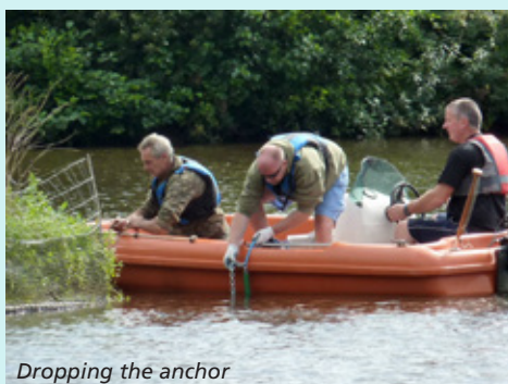
Dropping the anchor

Agency, which has carried out oxygen tests. The results were very good; 70 parts per million is a good average and, at the moment, the lake is showing over 100ppm, which is excellent. We will continue to monitor the situation in the hope that, as the water cools down in autumn, the algae will naturally die off. If the oxygen levels fall significantly, we may have to consider mechanical aerators.