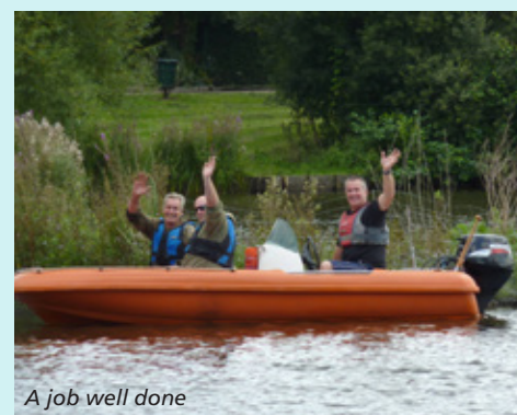
A job well done