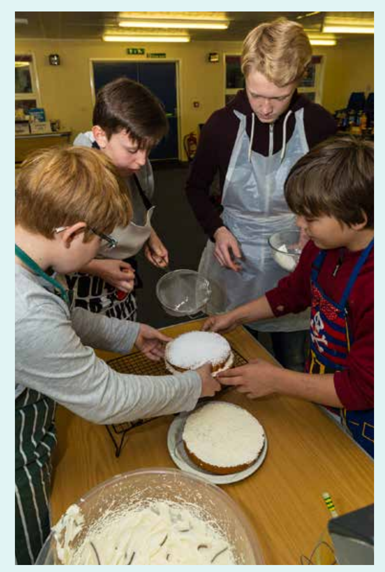
St Andrew's young people take on charity baking marathon.

A stunning riverboat trip with a delicious afternoon tea, departing from Walton-on-Thames and travelling to Hampton Court and back. £50 each or £80 for two; www.wsbhospices.co.uk/afternoontea or 01483 881752