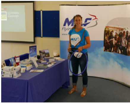
MAF Volunteers provided a display and aviation-related activities