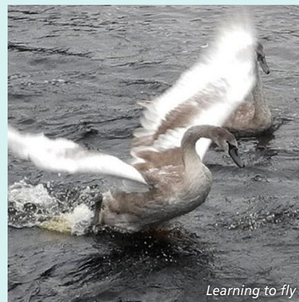
Learning to fly

to live on as independent swans. You will notice that there are only two cygnets now. One was injured and taken to the Swan Sanctuary in Staines but we hear that it is doing well. It will not be returned to the lake as the other cygnets will soon be banished from the lake, and so the process goes on in preparation for new life come the spring.