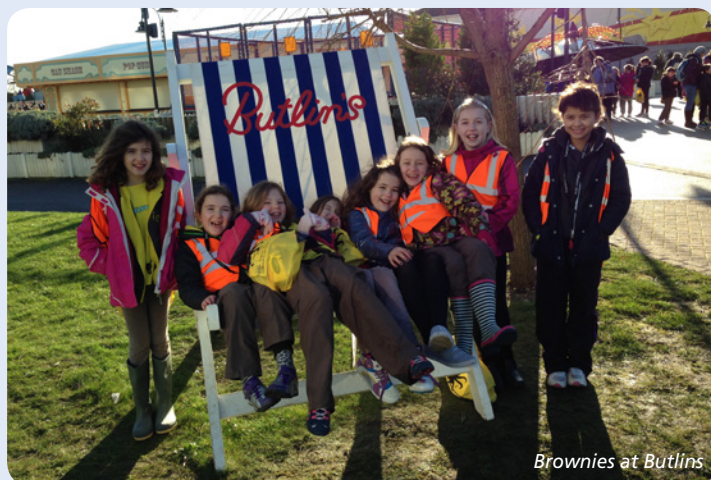
Brownies at Butlins

We currently have three Rainbow units, five Brownie packs and two Guide groups, which all meet throughout term time on a Monday, Tuesday and Friday. The groups provide a fantastic chance for girls aged between 5 – 16 years of age to learn new skills, be creative, make new friends and get involved with the community.