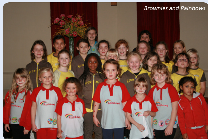
Brownies and Rainbows