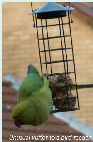
Unusual visitor to a bird feeder

At this time of year, many of us find our thoughts turning to clearing the garden of this season's growth, picking up leaves and covering our more delicate plants before the long cold nights of winter set in. There is one important job which is often forgotten and that is to clean bird feeders and tables by giving them a good scrub with a stiff brush and warm soapy water, then allow to air dry before refilling with fresh nuts, seeds, etc. This will help control the many diseases birds can get from dirty tables and rotting foods. We all love