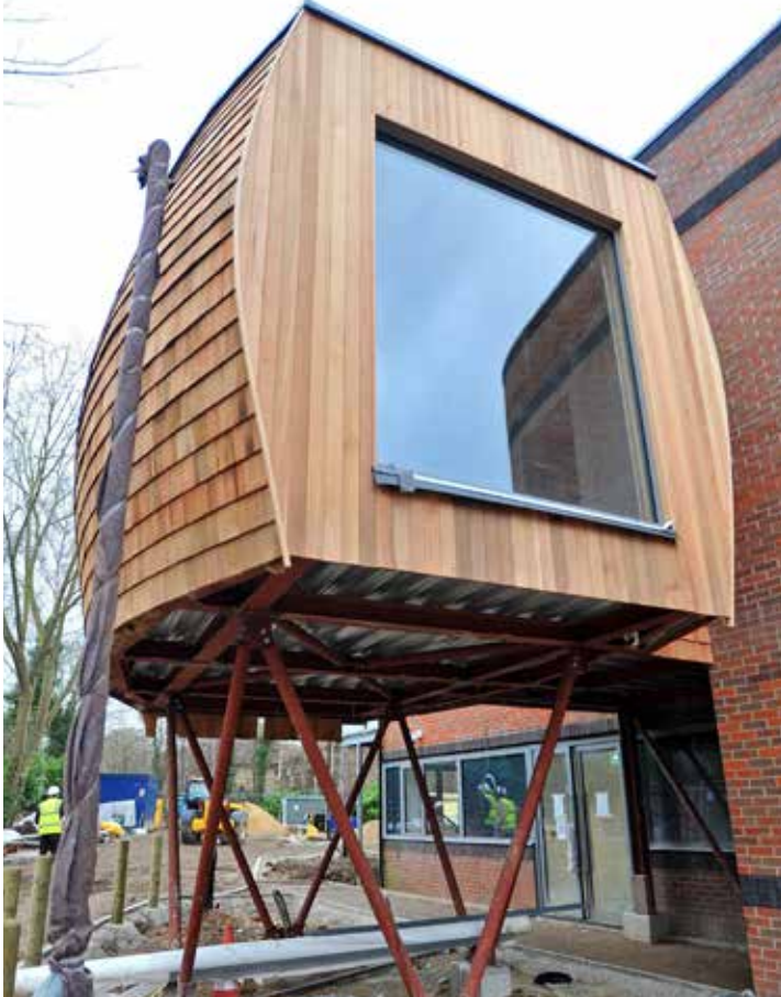
UNIQUE DESIGN – the family pod

The community team provides care, advice and support to more than 1,400 patients at home each year, improving their quality of life and helping them to live independently for as long as possible.