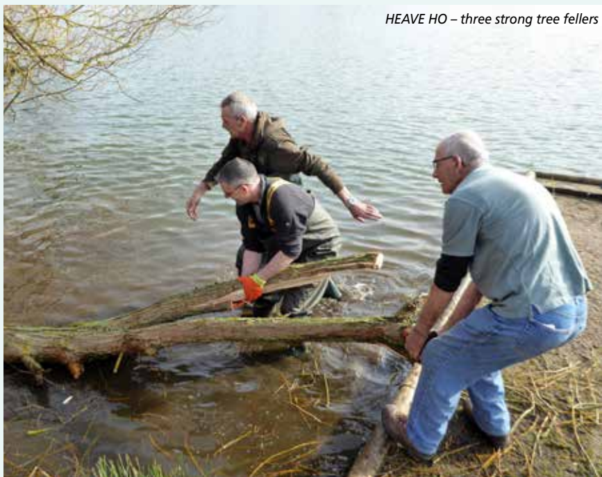
HEAVE HO – three strong tree fellers