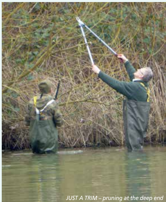
JUST A TRIM – pruning at the deep end

The GPCA's next outside project is a litter-pick on Saturday April 22, so if you can spare a couple of hours to clean up the area come and help us. Full details inside.