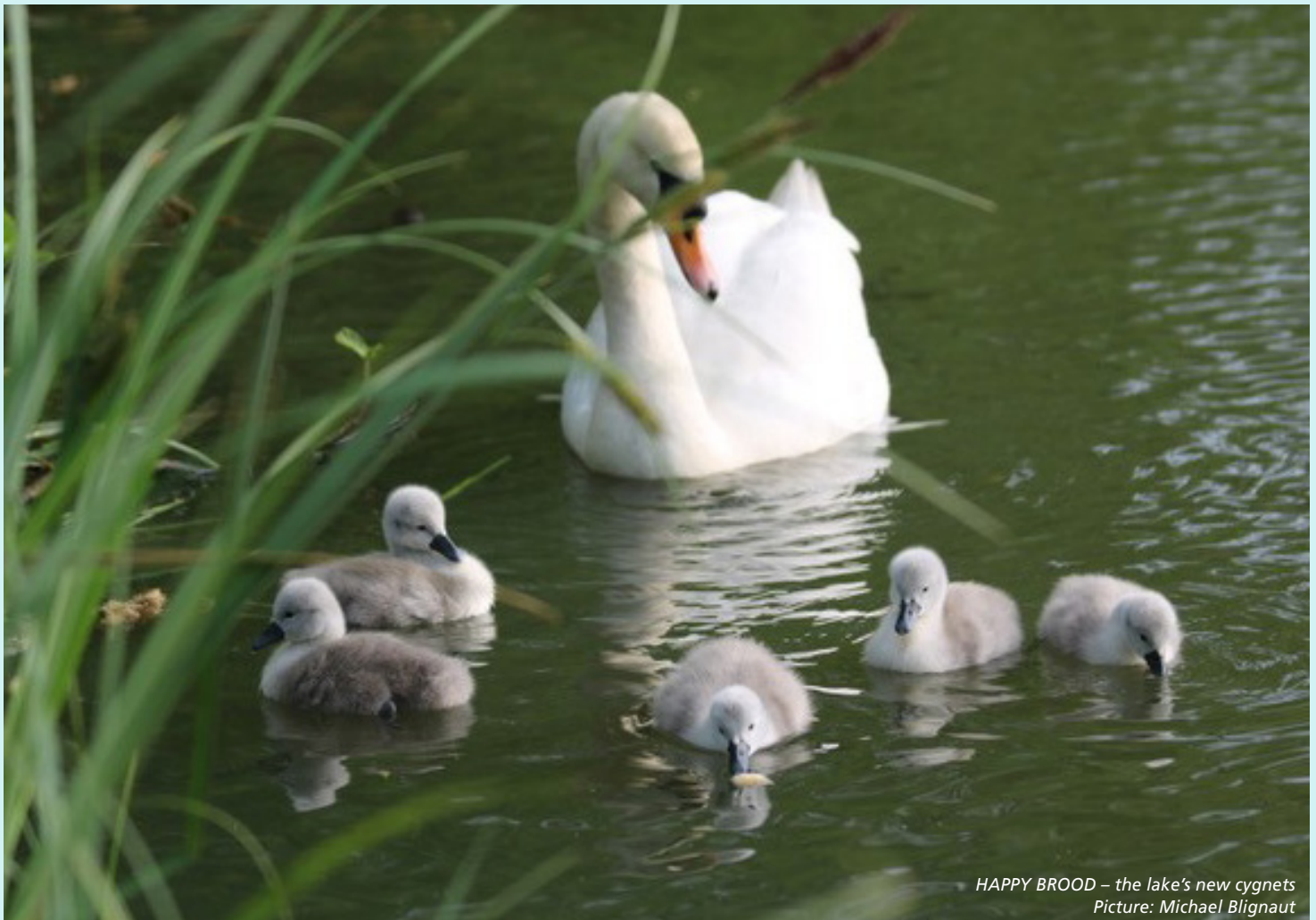
HAPPY BROOD – the lake's new cygnets

And finally, a reminder that our forthcoming Lets Go Fishing teaching program starts on August 2, designed for beginners to the sport or to hone your skills in angling. To take part in this FREE opportunity and book a place please contact me on 07779 896393 for times and details.