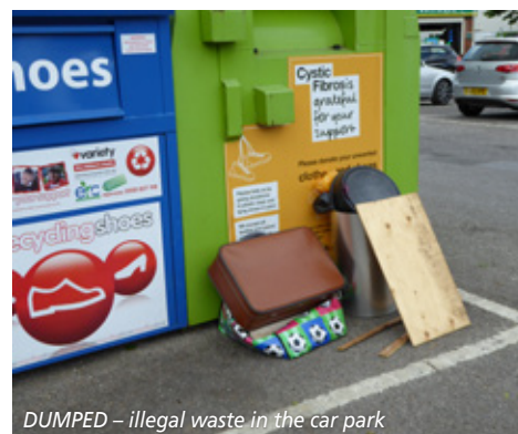
DUMPED – illegal waste in the car park