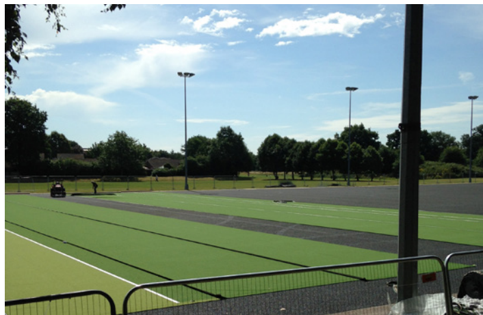
WORK IN PROGRESS – the new pitch is taking shape

CLS Sport have been awarded the contract and the work will bring the pitch up to International Hockey Federation national level and compliant for all levels of hockey including international matches.