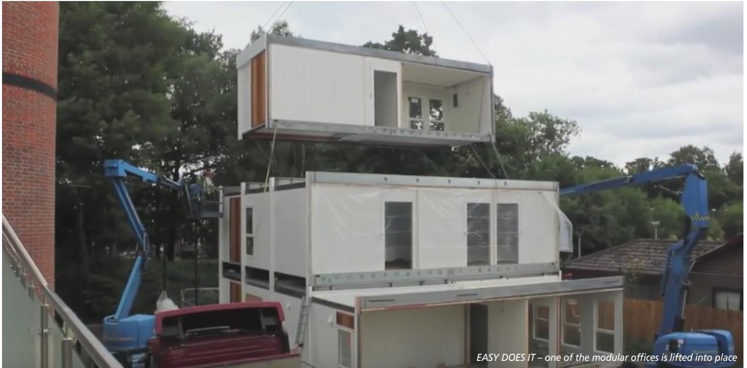
EASY DOES IT – one of the modular offices is lifted into place

THE new Woking Hospice took a step nearer completion on July 4 and 5 when modular buildings for the administration offices were lifted in by crane.