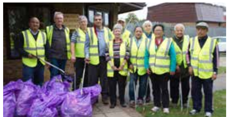
CLEANING UP – the GPCA organised another litter pick in October and volunteers collected over 20 bags of rubbish from around the estate