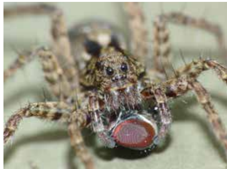
RARE SURREY RESIDENT - the Wolf Spider.

Email us your views at editor@ourgoldsworthpark.org.uk