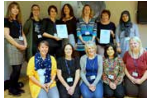
PROUD STAFF – Sythwood Children's Centre award winners

If you would like to find out more about the Centre please visit www.sythwoodchildrenscentre.co.uk