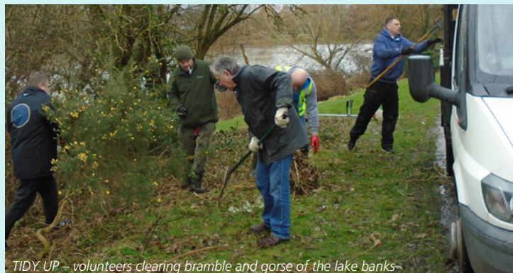
TIDY UP – volunteers clearing bramble and gorse of the lake banks

Again, a number of our fishermen have been busy round the lake, this time trimming back some of the bramble bushes that have got out of hand, with a lot dead material choking good healthy growth. In addition, there were one or two areas where the bushes are used as litter bins, making it very unsightly and difficult to tidy. Despite looking rather bare at first, new growth will quickly come back and should encourage a better fruit crop later in the year. Once again,