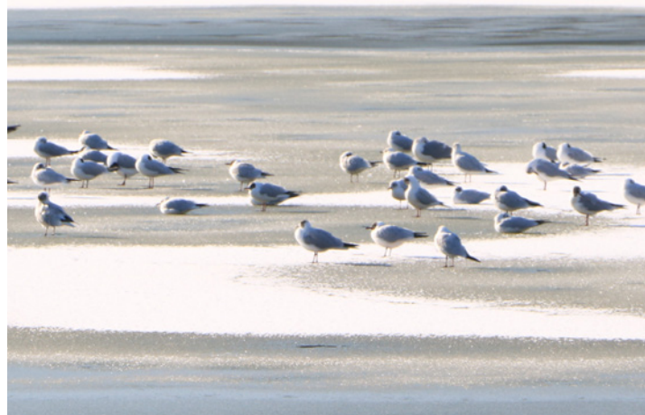
WHAT SPRING? – a wintery March scene on the lake

Birds sing extra loudly at dawn because it's not a good time to go foraging for food. So they focus their efforts on trying to attract a mate and hold a