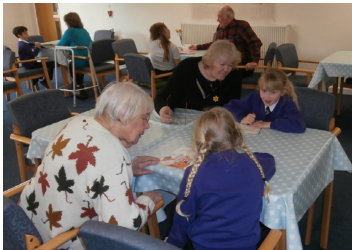
SPELL CHECK – residents and Beaufort pupils enjoy the reading session

If you have concerns about your memory, or that of a friend or relative, you can discuss your concerns in confidence at the café with trained volunteers. It is a free service.