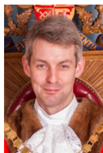
WOKING MAYOR WILL FORSTER

The new Mayor is looking forward to discovering the good work being done by the many voluntary organisations across the Borough.