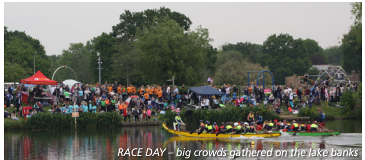
RACE DAY – big crowds gathered on the lake banks