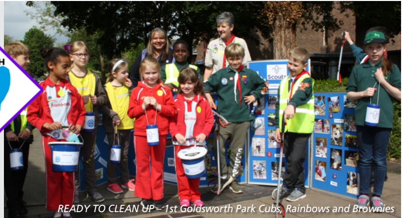
READY TO CLEAN UP – 1st Goldsworth Park Cubs, Rainbows and Brownies

VALHALLA Netball Club, which plays matches at Winston Churchill School and trains at Sythwood School, is looking to expand and would welcome new members.