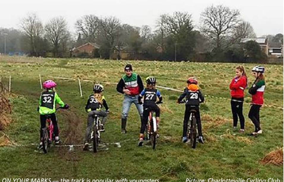
ON YOUR MARKS — the track is popular with youngsters

Go-Ride is British Cycling's development programme for young people. Go-ride skills coaching sessions are run in a traffic free environment to develop the core skills for fun, safe and fast cycling.