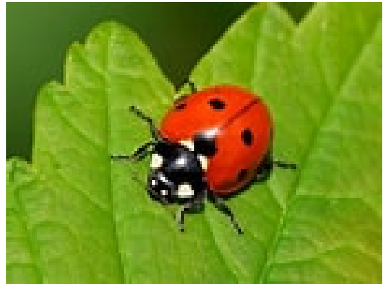
• Meadow, lake and woodland insects