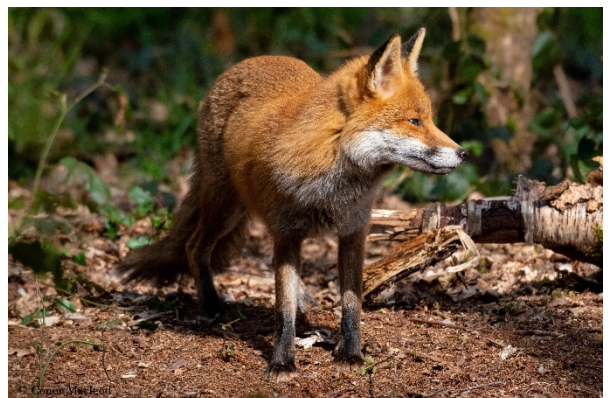
• Mammals (Connor Macleod)