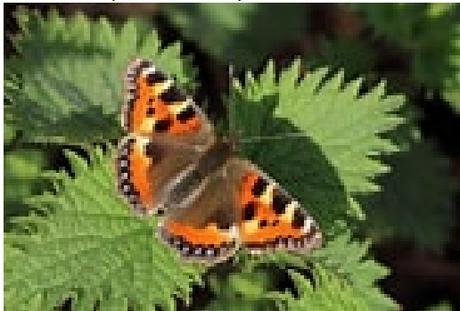
• Butterflies and moths