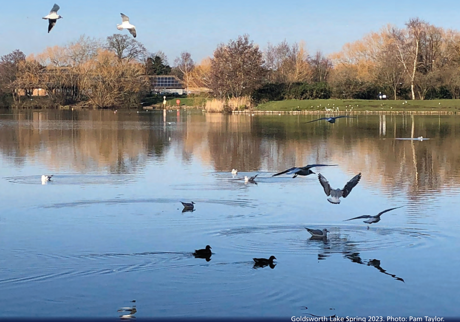
Goldsworth Lake Spring 2023.

GPCA Goldsworth Park Community Association CIO www.ourgoldsworthpark.org.uk