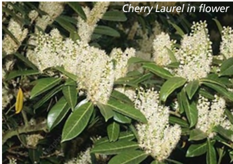
Cherry Laurel in flower