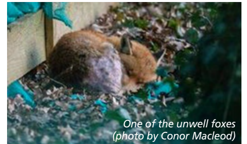
One of the unwell foxes

A NGP Facebook Group member recently drew attention to the plight of a group of foxes which is often seen on the former Lakers site. They are suffering from mange and he is trying to gain access to the site to administer medication. Hopefully he will be successful. It is great to find local residents taking an active interest in supporting and helping the Park's wildlife.